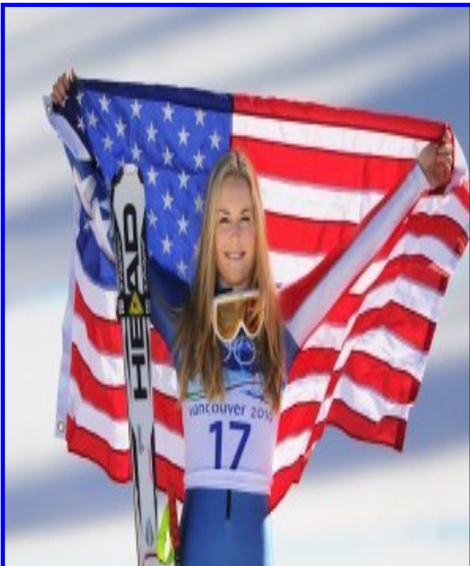
An American skier shows the flag at the moment of Olympic victory.