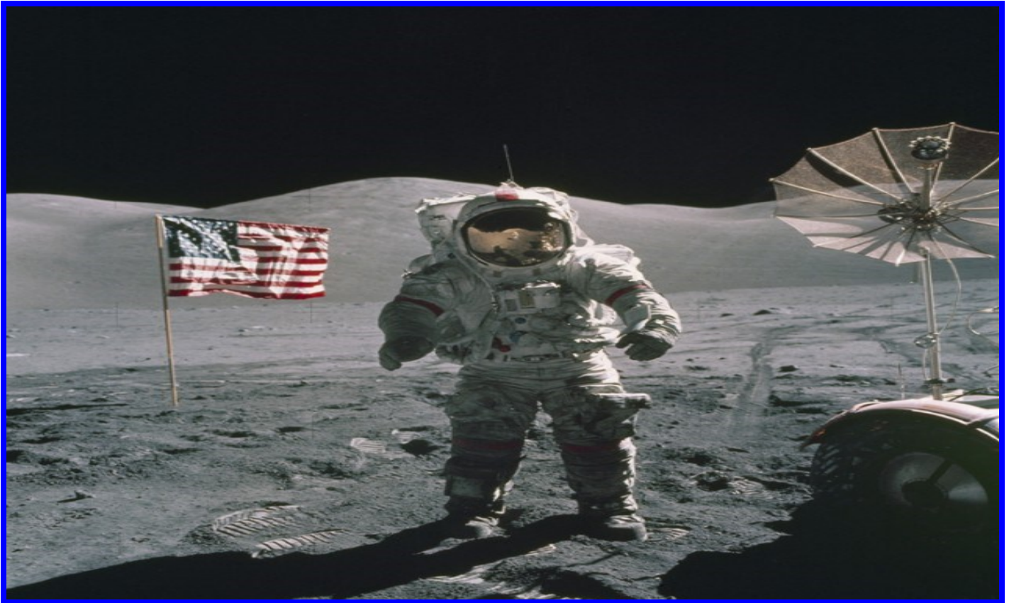
Americans were the first, and so far the only human beings to set foot on the moon. What else would the astronauts use to mark the landing but the flag, seen here in this 1969 photo.