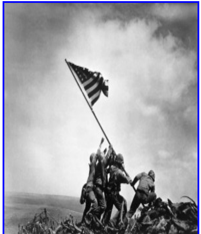
In this famous World War II photo from 1945, marines raise the flag over Iwo Jima, signaling a key victory for the United States.